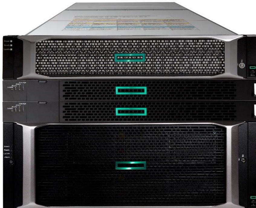
HPE XP8 Storage

HPE XP8 is available in two models: HPE XP8 All-Flash Storage Array and HPE XP8 Hybrid Array. Both models can be purchased in either Base (2-controller) or Performance (4-controller) versions and can scale up to a fully loaded 12-controller configuration.